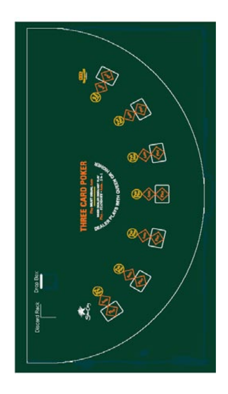
Diagram "A" THREE CARD POKER LAYOUT