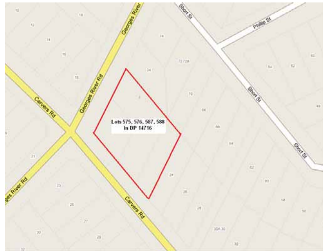
ATTACHMENT MAP: LAND TO WHICH NOTICE NO. 21129 APPLIES SHELL-COLES EXPRESS, 20 CARVERS ROAD, OYSTER BAY, NSW, 2225 LOTS 575, 576, 587, 588 in DP 14716

This declaration does not affect the provisions of any relevant environmental planning instruments which apply to the land or provisions of any other environmental protection legislation administered by the EPA.