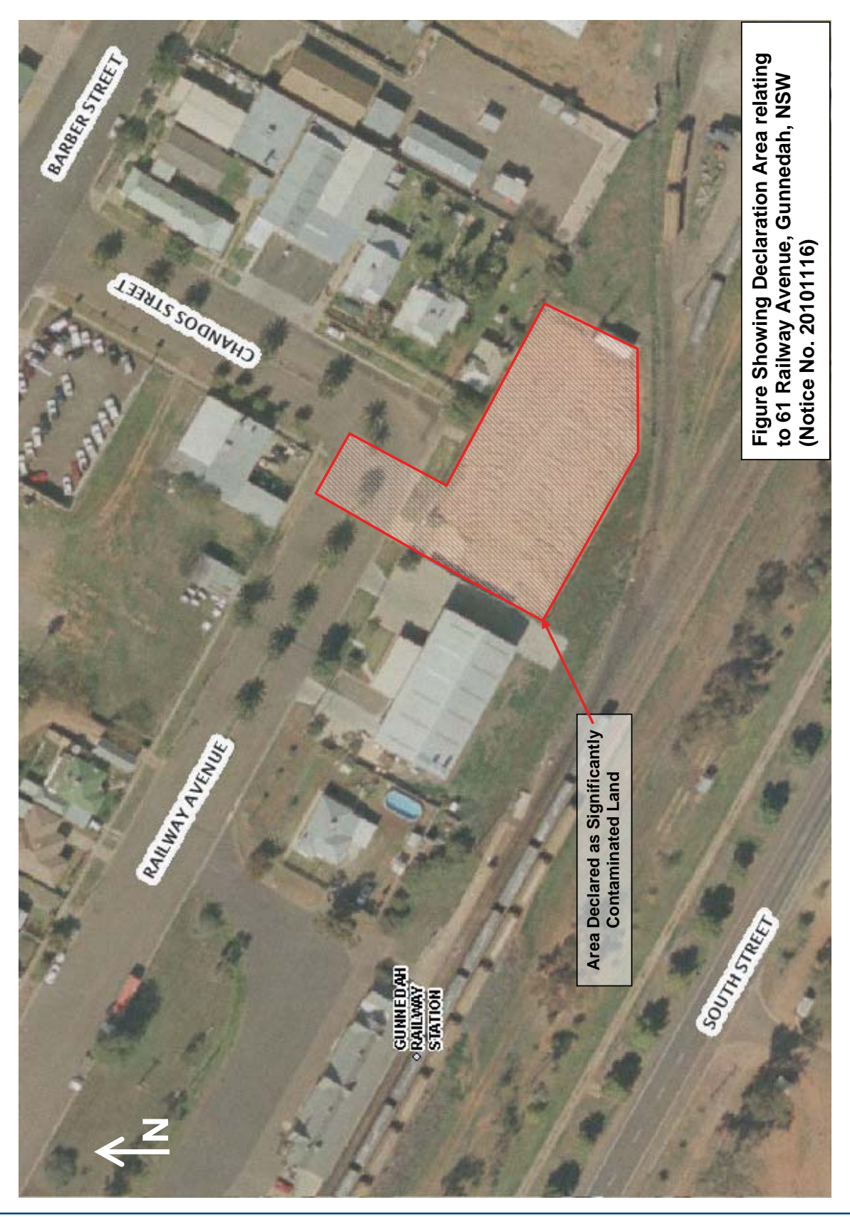
NEW SOUTH WALES GOVERNMENT GAZETTE No. 128

This declaration does not affect the provisions of any relevant environmental planning instruments which apply to the land or provisions of any other environmental protection legislation administered by the EPA.