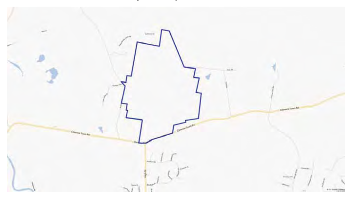
In this Order, this map is for information purposes and does not limit the description of the area in Schedule 1 above.