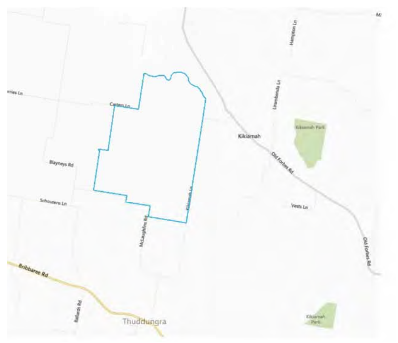
SCHEDULE 2 - Map of Restricted Area No. 2

SCHEDULE 3 - Classes of animals, animal products, fodder, fittings, soil and vehicles