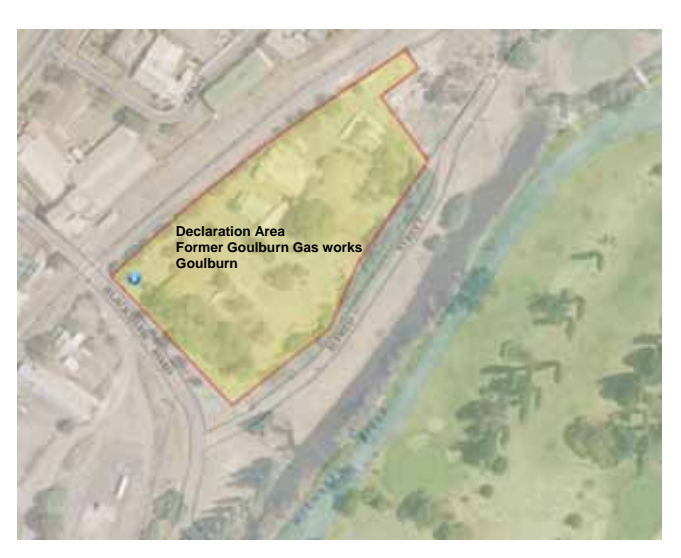
Figure 1. Land to which this declaration applies, 1 Blackshaw Road, Goulburn NSW

This declaration does not affect the provisions of any relevant environmental planning instruments which apply to the land or provisions of any other environmental protection legislation administered by the EPA.