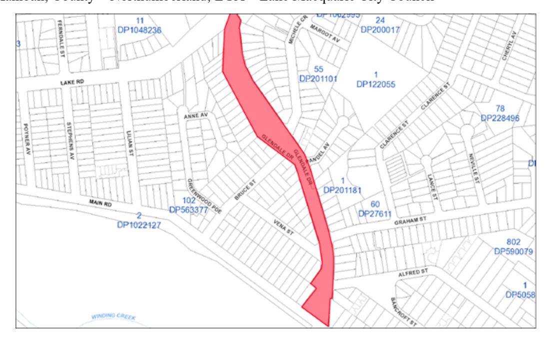
Parish - Kahibah; County - Northumberland; LGA - Lake Macquarie City Council