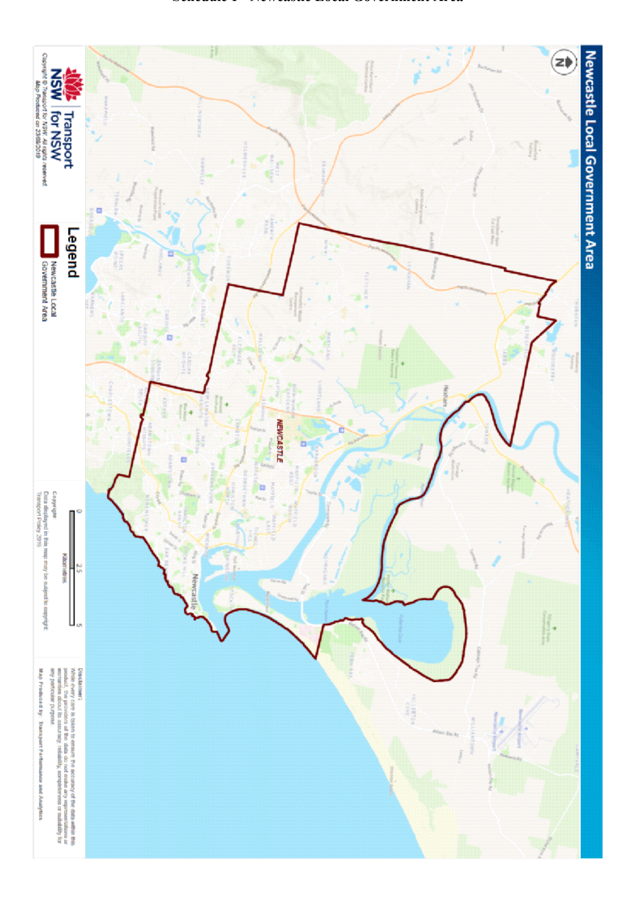
Schedule 1 - Newcastle Local Government Area