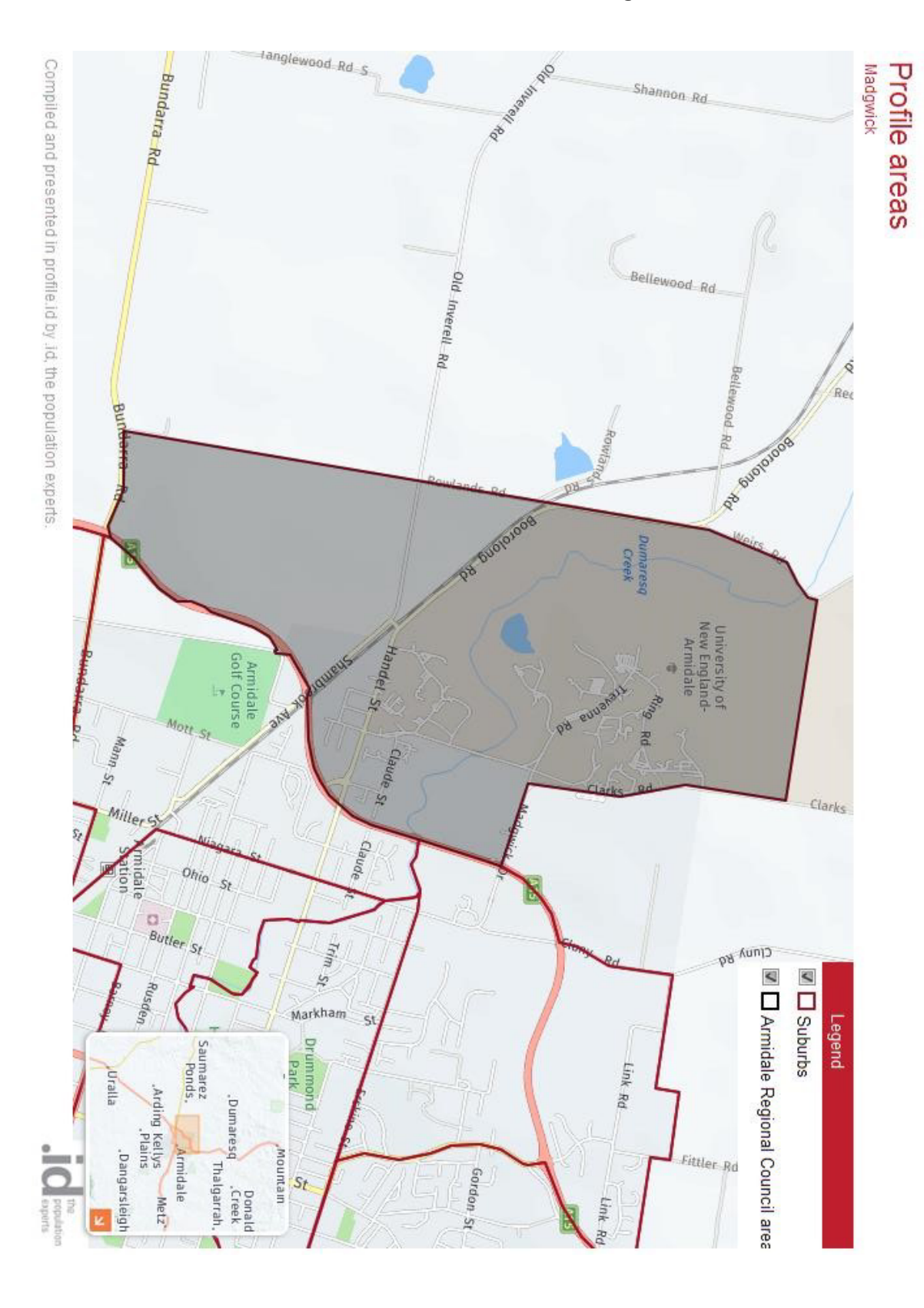
Schedule 2 - Suburb boundaries of Madgwick