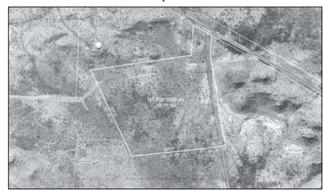
BARKLY WORK CAMP ILUA AREA NT POR 7099(A) PEKO ROAD TENNANT CREEK LOCALITY

Commencing from a point 27 degrees 44 minutes 30 seconds 170.1 metres from the south east corner of NT Portion 565, thence bounded by lines 82 degrees 01 minutes 539.33 metres; thence 3 degrees 51 minutes 30 seconds 159.56 metres to intersect the southern boundary of Peko Road, thence 119 degrees 10 minutes 111.45 metres along the southern boundary of Peko Road; thence 183 degrees 51 minutes 30 seconds 103.51 metres; thence 170 degrees 53 minutes 30 seconds 485.45 metres; thence 261 degrees 21 minutes 30 seconds 100.24 metres; thence 264 degrees 29 minutes 398.59 metres; thence 334 degrees 38 minutes 30 seconds 504.82 metres to the point of commencement.