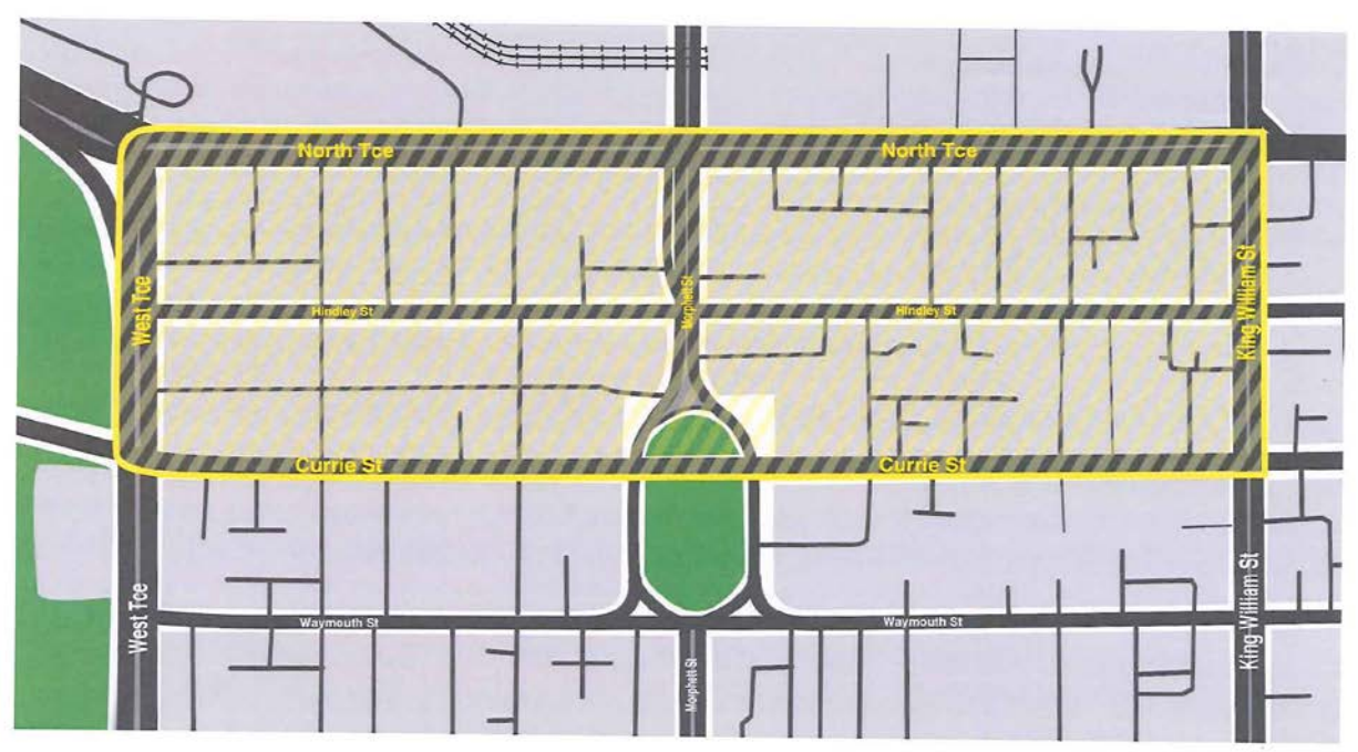
Dated 2 November 2017.