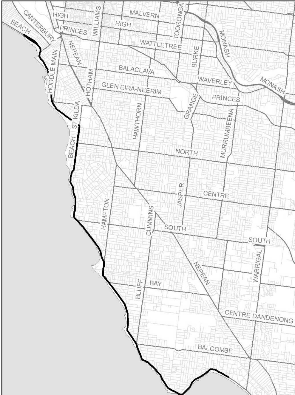
DIAGRAM SHOWING ROUTE OF CYCLING ROAD RACES AND ASSOCIATED FAMILIARISATION SESSION