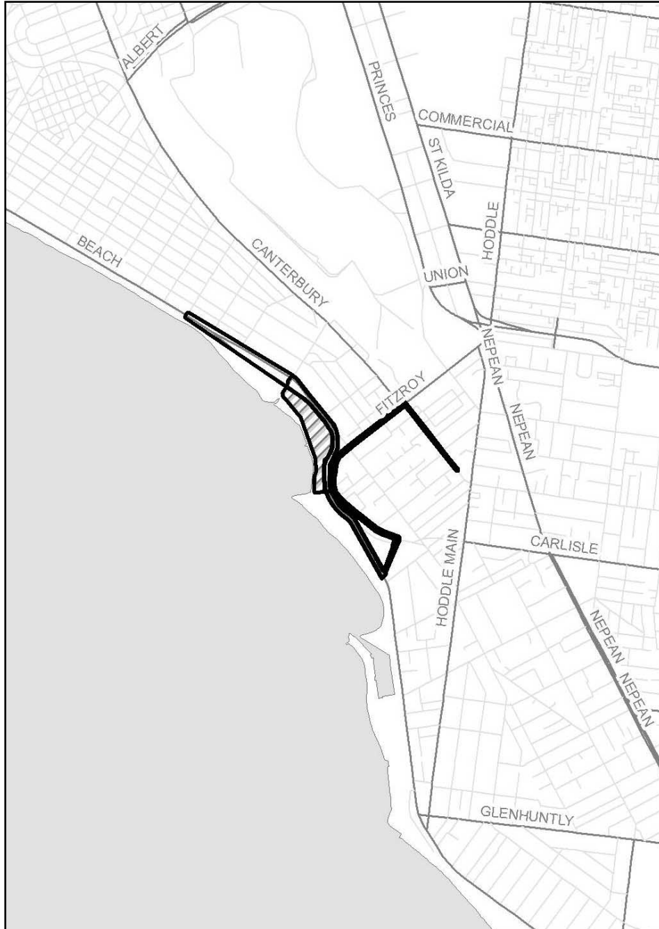
DIAGRAM SHOWING ROUTE OF TRIATHLONS