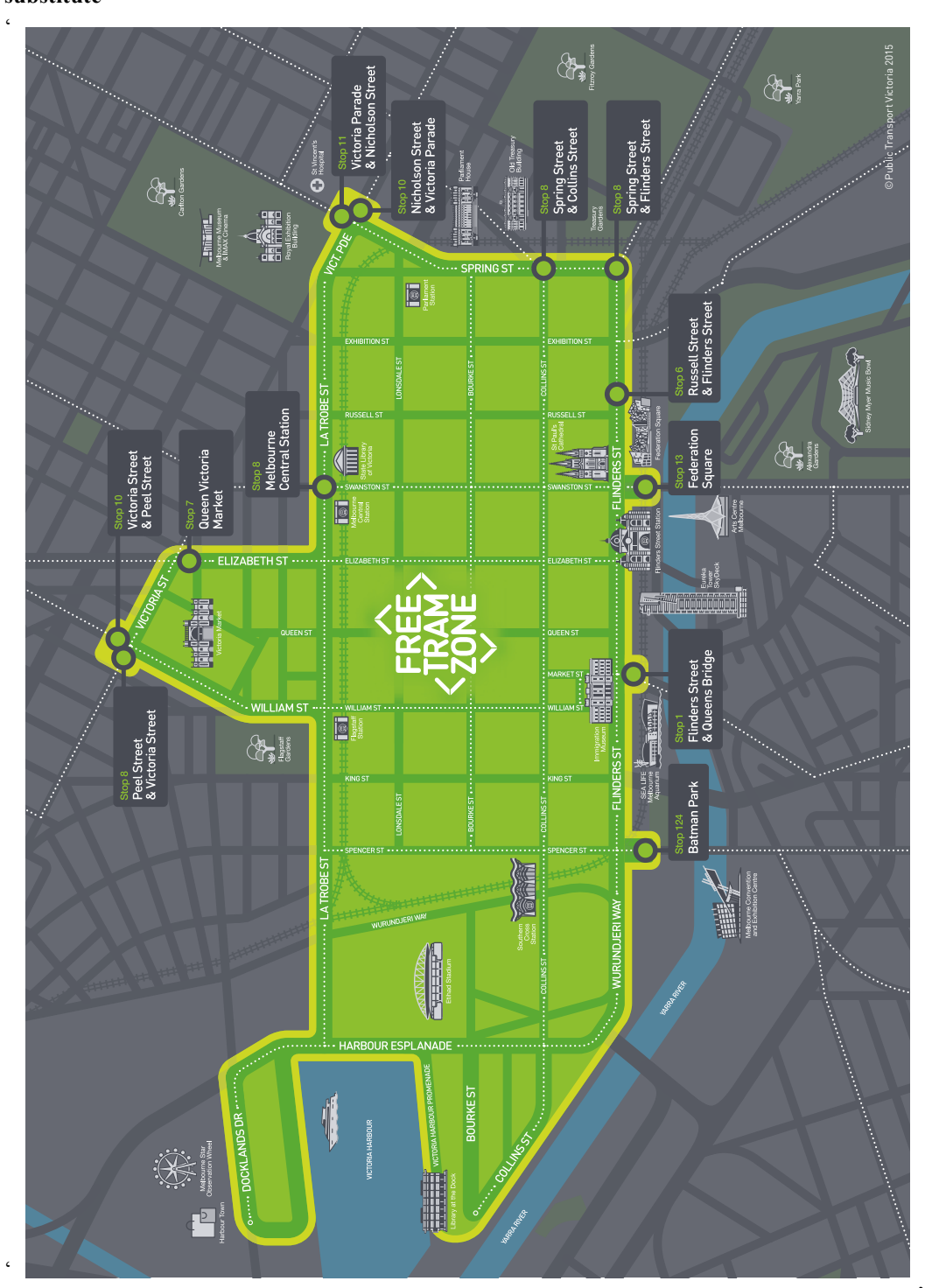
In Chapter 9 of the Manual, for the map under the heading 'FREE TRAM ZONE MAP' substitute –