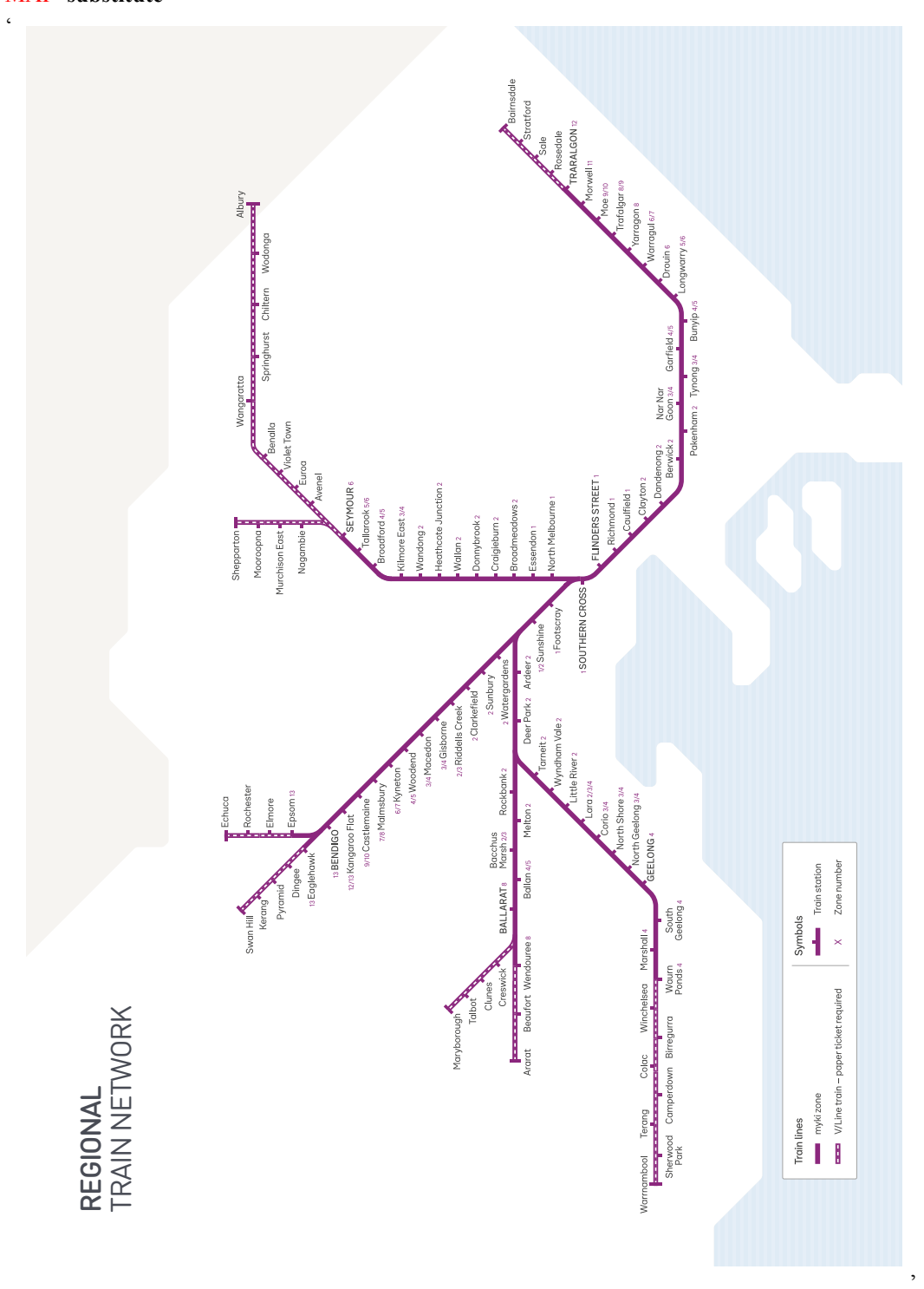
In Chapter 9 of the Manual, for the map under the heading 'REGIONAL TRAIN MYKI ZONES MAP' substitute –