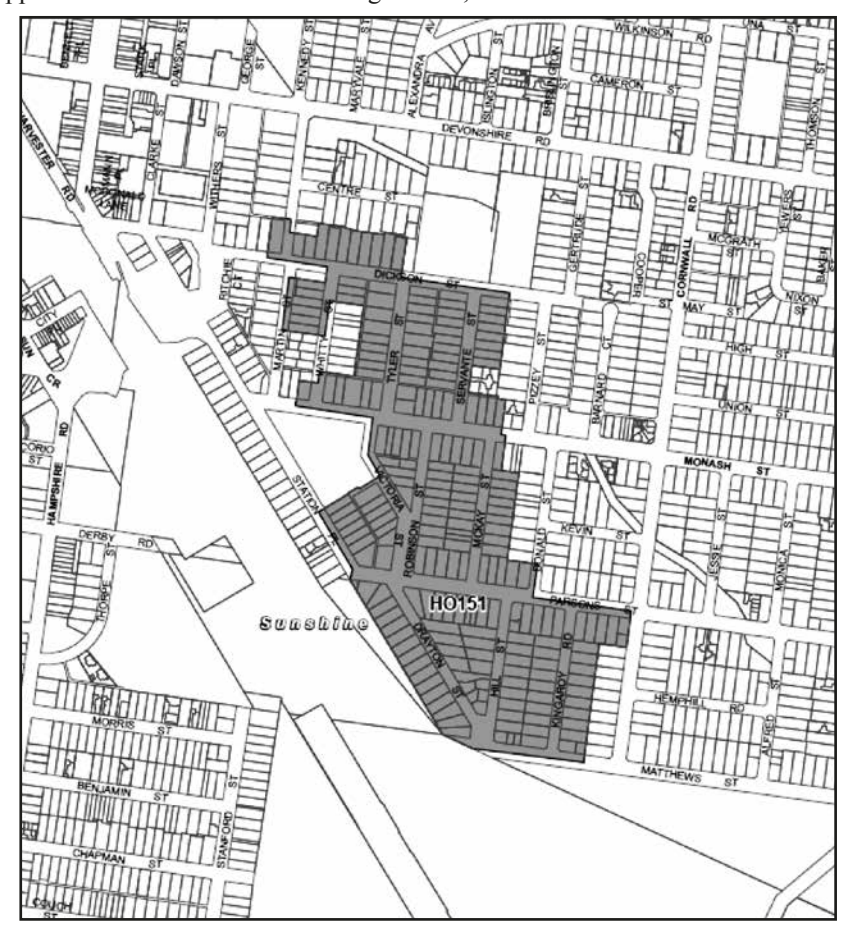
Map: Land affected by the Amendment – Grand Junction Estate and Matthews Hill Precinct, Sunshine Brimbank C200 001hoMap12 Exhibition

The land affected by the Amendment is within the 'Precinct Boundary' shown in Map below, and also applies to land known as 108 George Street, St Albans.