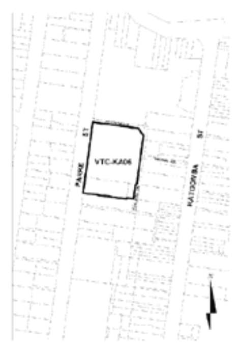
Katoomba Precinct VTC-KA06—Cultural Precinct

(1) This Division applies to land shown edged heavy black on the locality plan below named "Katoomba Precinct VTC–KA06—Cultural Precinct" and shown by distinctive edging and annotated "VTC–KA06" on Map Panel A.